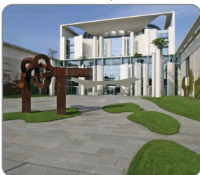
State Theatre, Stuttgart (DE)